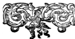
Item 40, detail

Descriptions of condition are not warranties. The descriptions of condition of articles in this catalogue, including all references to damage or repairs, are provided as a service to interested clients and do not negate or modify the Limited Warranty. Accordingly, all lots should be viewed personally by prospective buyers or their agents to evaluate the condition of the property offered for sale.